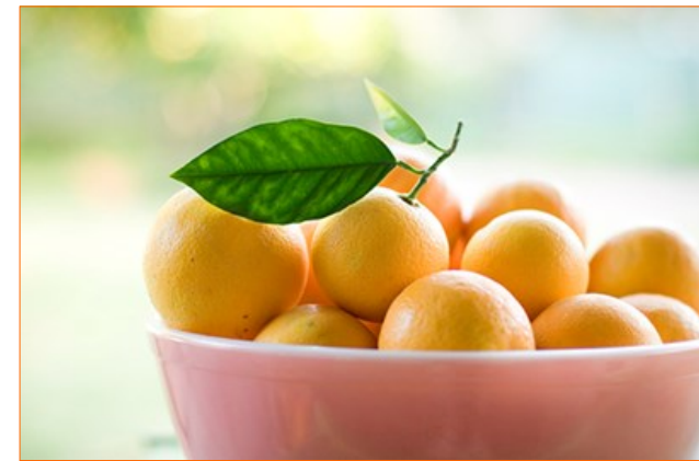
Chart your Course & Intentional Living

Peace and a sense of wellbeing don't come to us from a life free of challenges. They come from an inner certainty that you are living your best self and you are equipped to deal with what life has in store. Our mind, heart, spirit, and body are meant to work together to help us live out the fullness of who we are and what we are meant to do. Where are your blockers? How do you clear them and help all parts of yourself align with your true purpose?