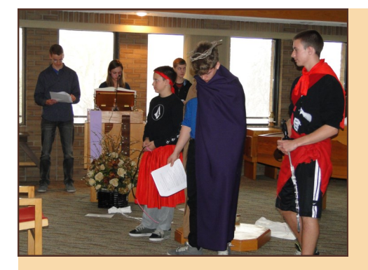
The Easter Triduum at Queen's House. Building memories that last a lifetime. Deepening faith in community.