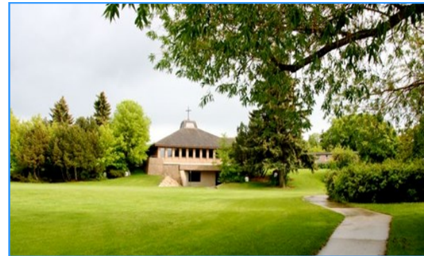
(Edited May 15, 2018)

You may be also be interested in a personal retreat or one of the retreats being offered at Queen's House. Please visit: www.queenshouse.org