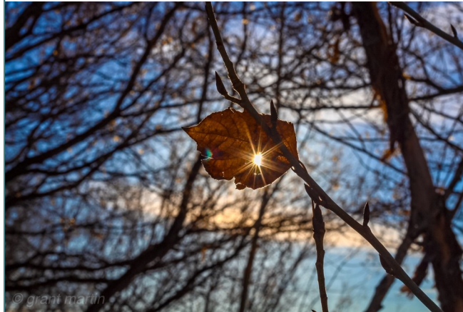
taken on the grounds of Queen's House