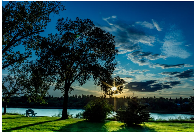
on the grounds of Queen's House