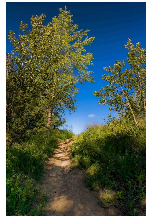
Taken on the grounds of Queen's House