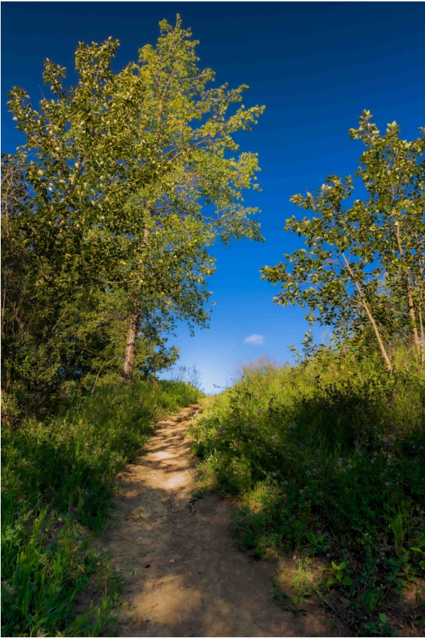
Taken on the grounds of Queen's House