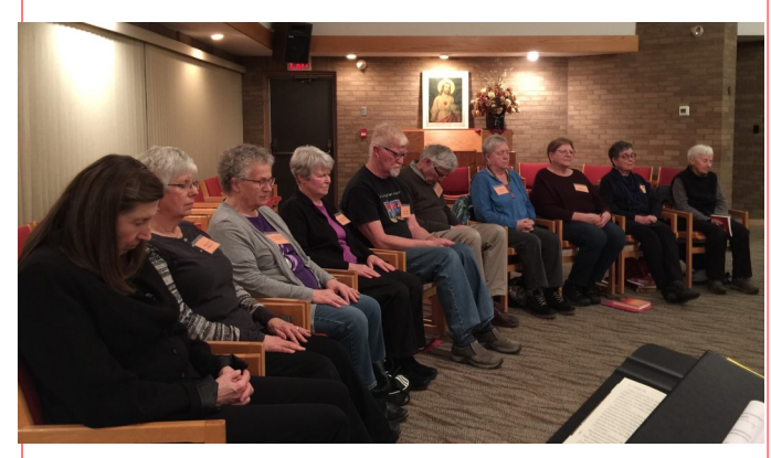
Participants enter into Centering Prayer during a book study series in the Main Chapel - January 2020

Come for one or many Monday evenings - you are always welcome!