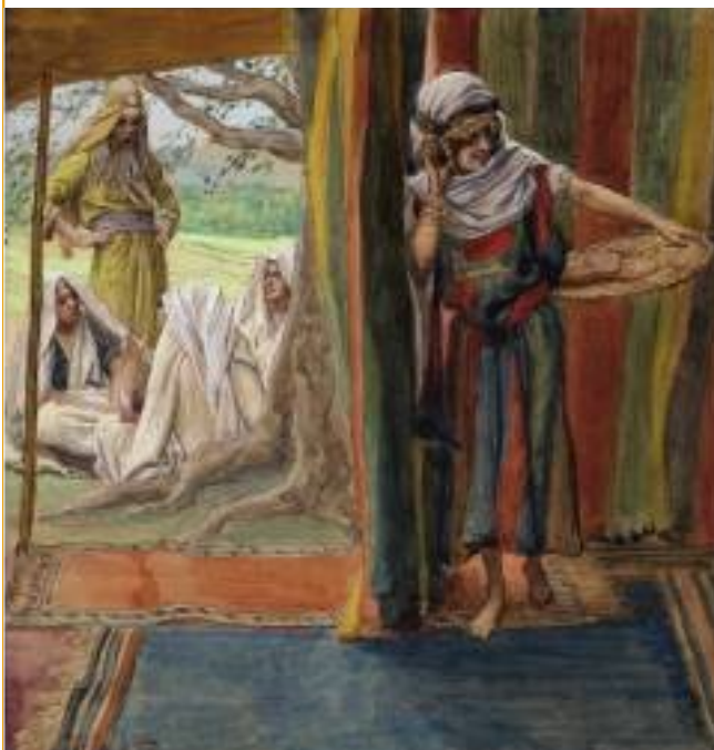
Sarah Hears and Laughs (c. 1896-1901) James Jacques Joseph Tissot (French, 1836-1902)