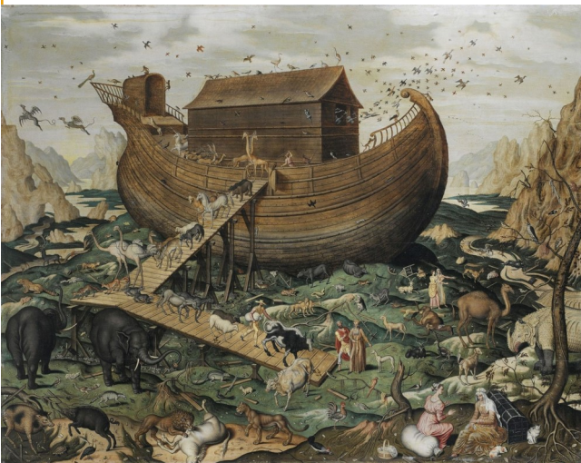
Noah's Ark On The Mount Ararat (1570) - Simon de Myle

Have you ever tried reading through the Old Testament, only to find yourself stalled at Leviticus? Or wondering what's the difference between the Exodus and the Exile? What are all those prophets complaining about? And why does God seem so angry all the time?