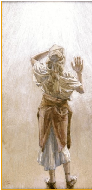
God Appears to Noah (1896-1902) James Jacques Joseph Tissot (French, 1836-1902)