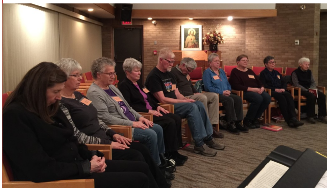
Participants enter into Centering Prayer during a book study series in the Main Chapel - January 2020

Come for one or many Monday evenings - you are always welcome!