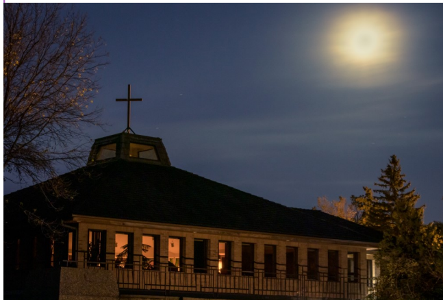
Main Chapel, Queen's House